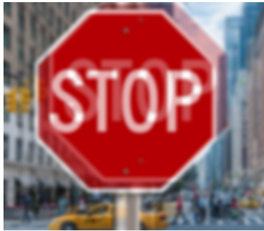
Double vision can be a symptom of Thyroid Eye Disease.

forward. It may be possible that symptoms may appear in one eye more than the other.